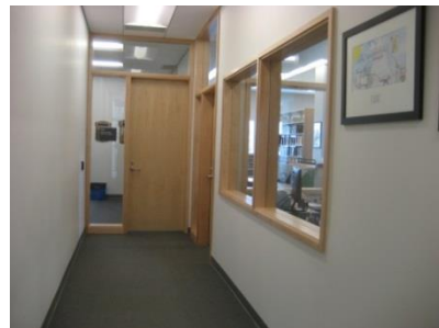
Hallway to lounge/library