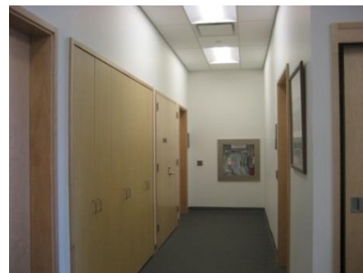
Turn left upon entering to the lounge to access the Gowning rooms

A Keurig machine is located in the lounge's kitchenette. Coffee & tea supplies are available for $1.00/cup!